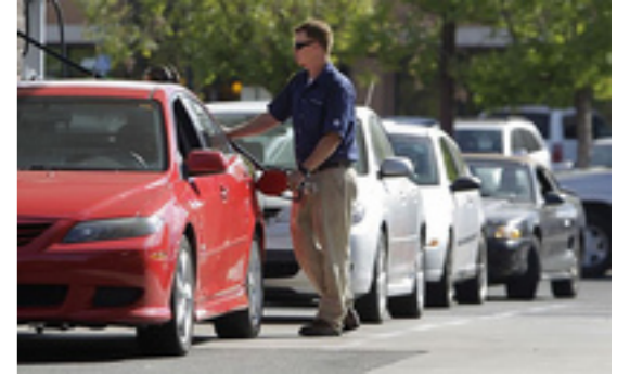
Cars line up to get gas at a Costco station in Sacramento.

If the Costco will bring in 4,000-5,000 customers per day (per Westfield's estimates a couple of years ago), how many more cars will they bring in if a mega-gas station is offered? I can only hope that someone has a camera when Costco opens and takes the pictures to the hearings.